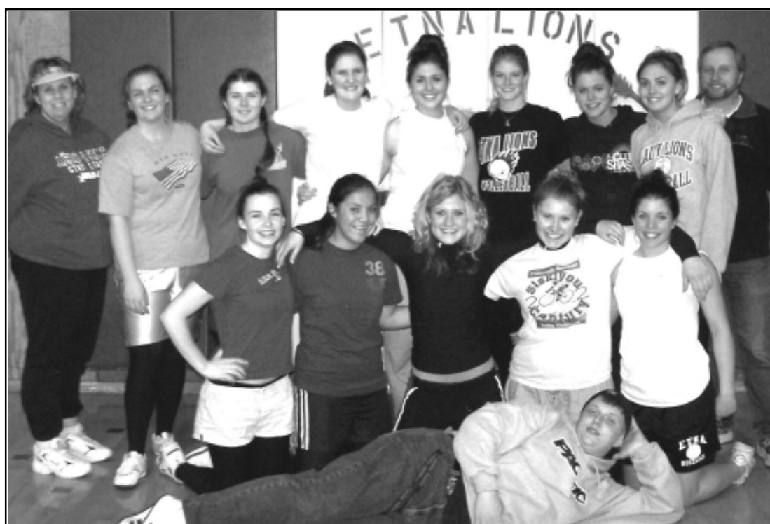
The Varsity Girls Softball teams poses for a photo at their practice to get ready for the upcoming season.

When asked if she knew why there were new